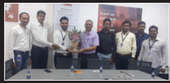
Industry Institute Interaction (Faculty Visit @ SETCO Spindles, Pune)