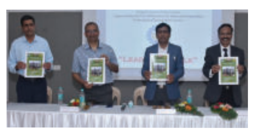
Publication of our First Newsletter